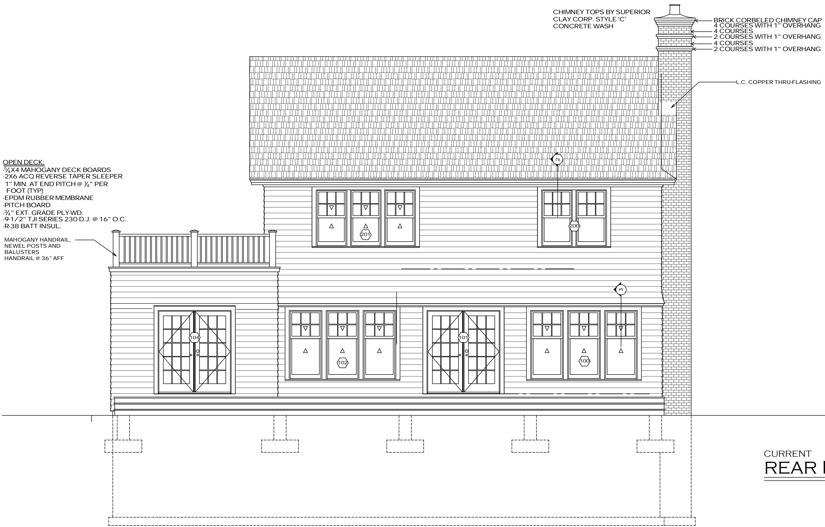
CURRENT REAR ELEVATION