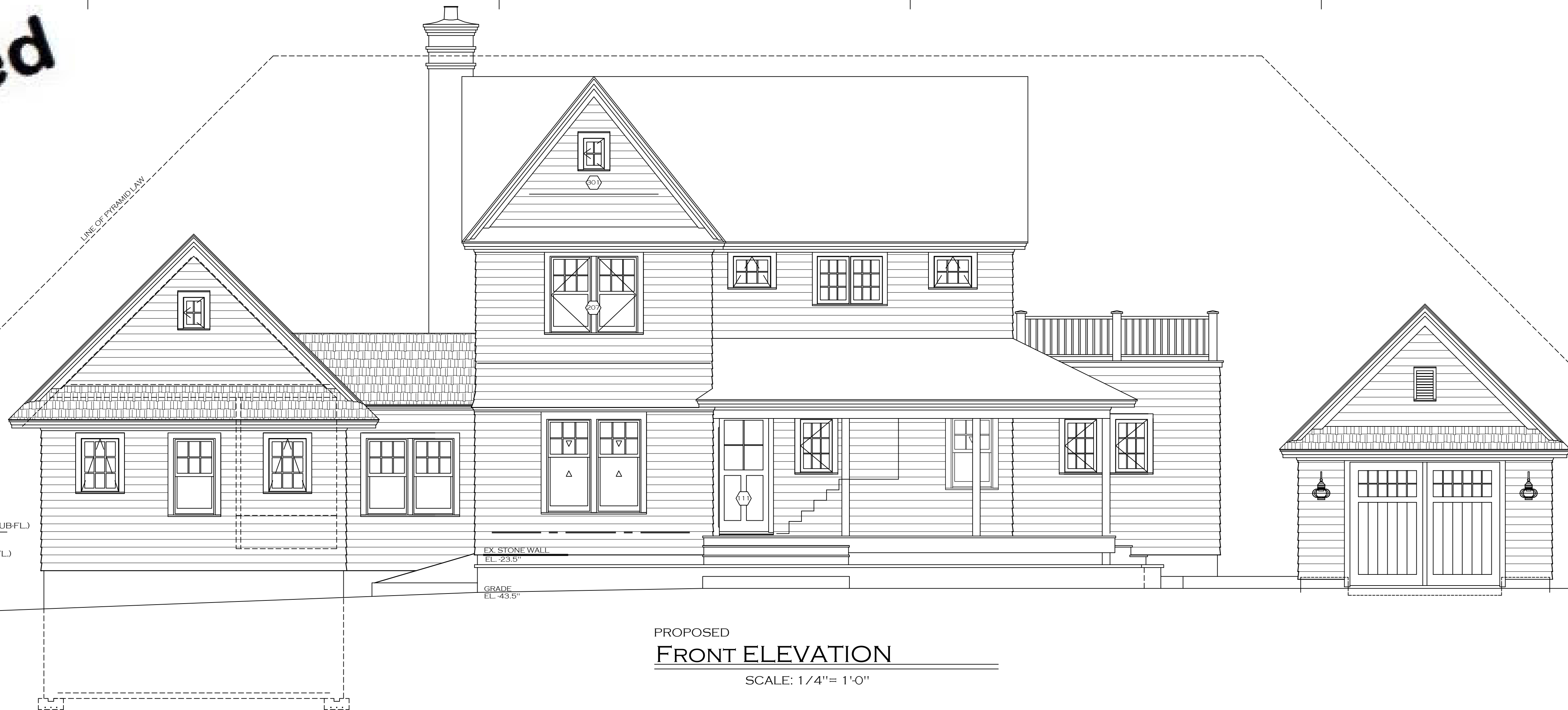
PROPOSED FRONT ELEVATION SCALE: 1/4" = 1'-0"