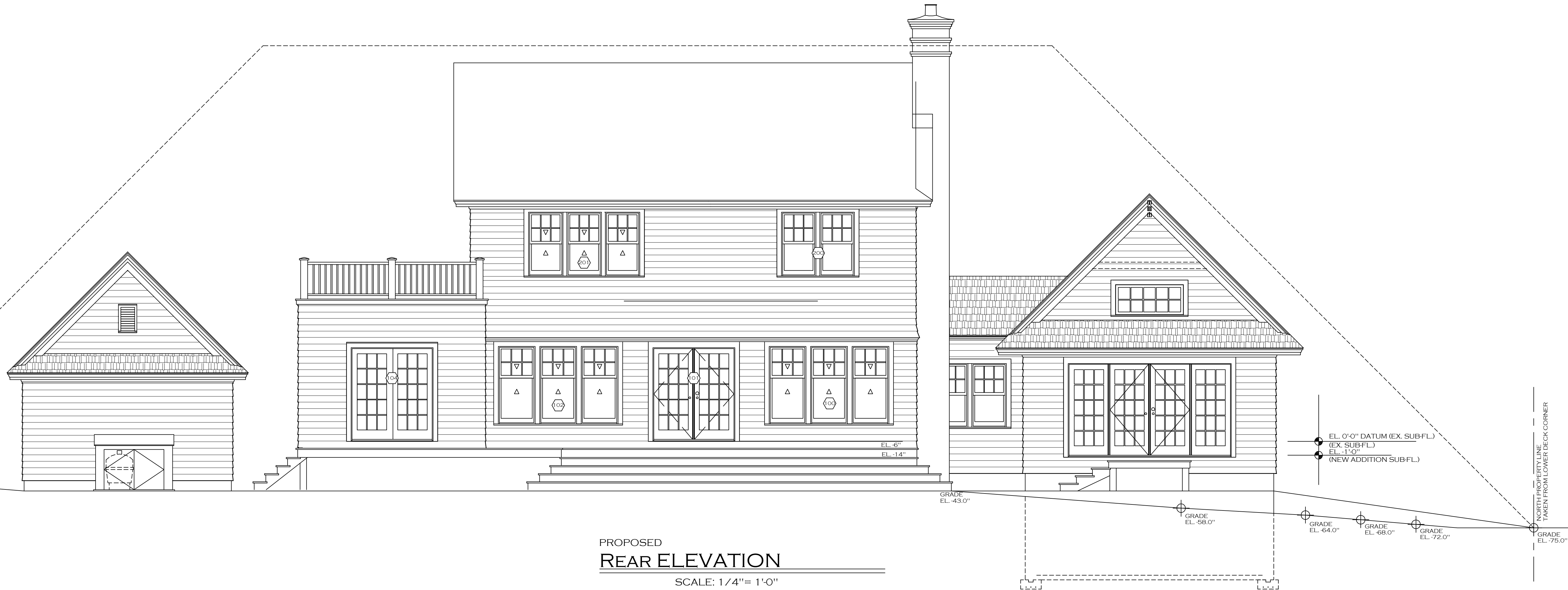
PROPOSED REAR ELEVATION SCALE: 1/4" = 1'-0"

BRUCE A.T. SISKAA ARCHITECT-PLLC 61N. MAIN STREET EAST HAMPTON, NY 11937 T 631.324.1791 F 631.324.1695