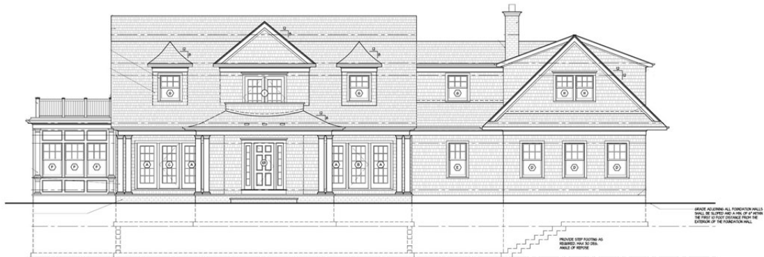
1 PROPOSED FRONT ELEVATION