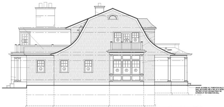
2 PROPOSED LEFT SIDE ELEVATION