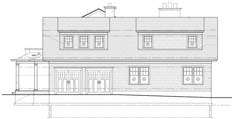
2 PROPOSED RIGHT SIDE ELEVATION