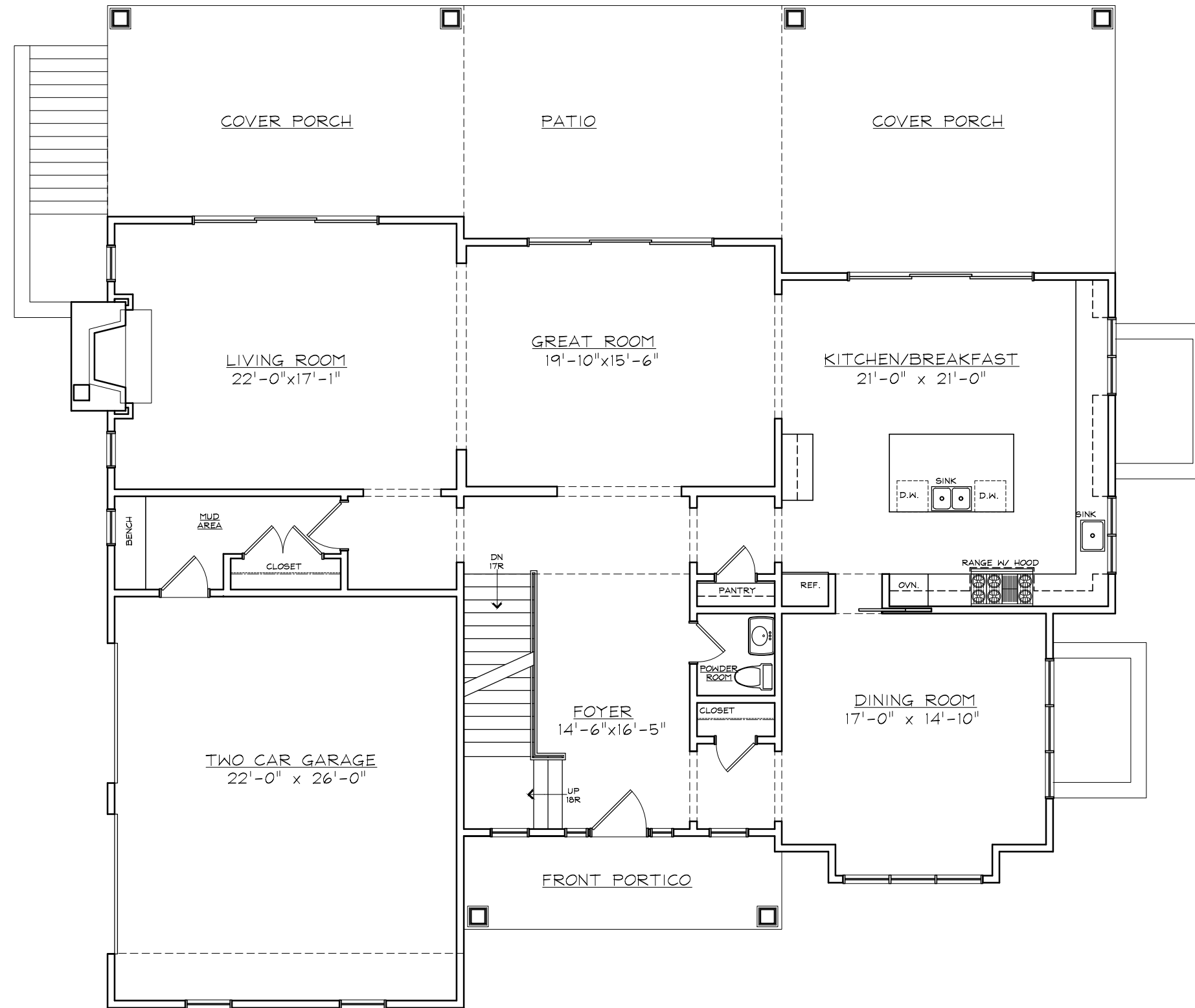
FIRST FLOOR PLAN DEERFIELD ROAD (LOT # 14)