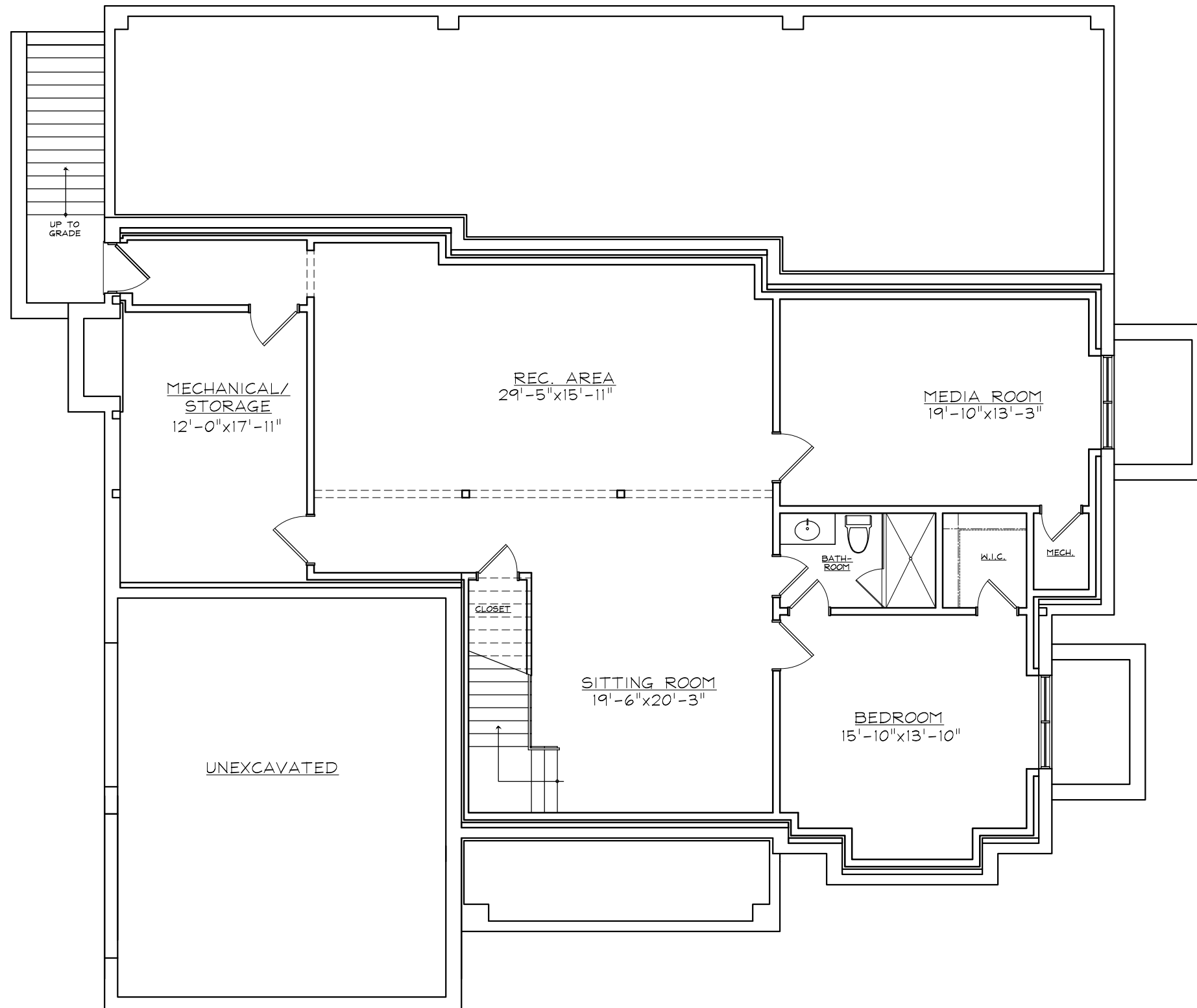
BASEMENT PLAN DEERFIELD ROAD (LOT #14) 1,922 SQ.FT.