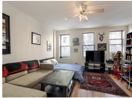
Six free market rentals