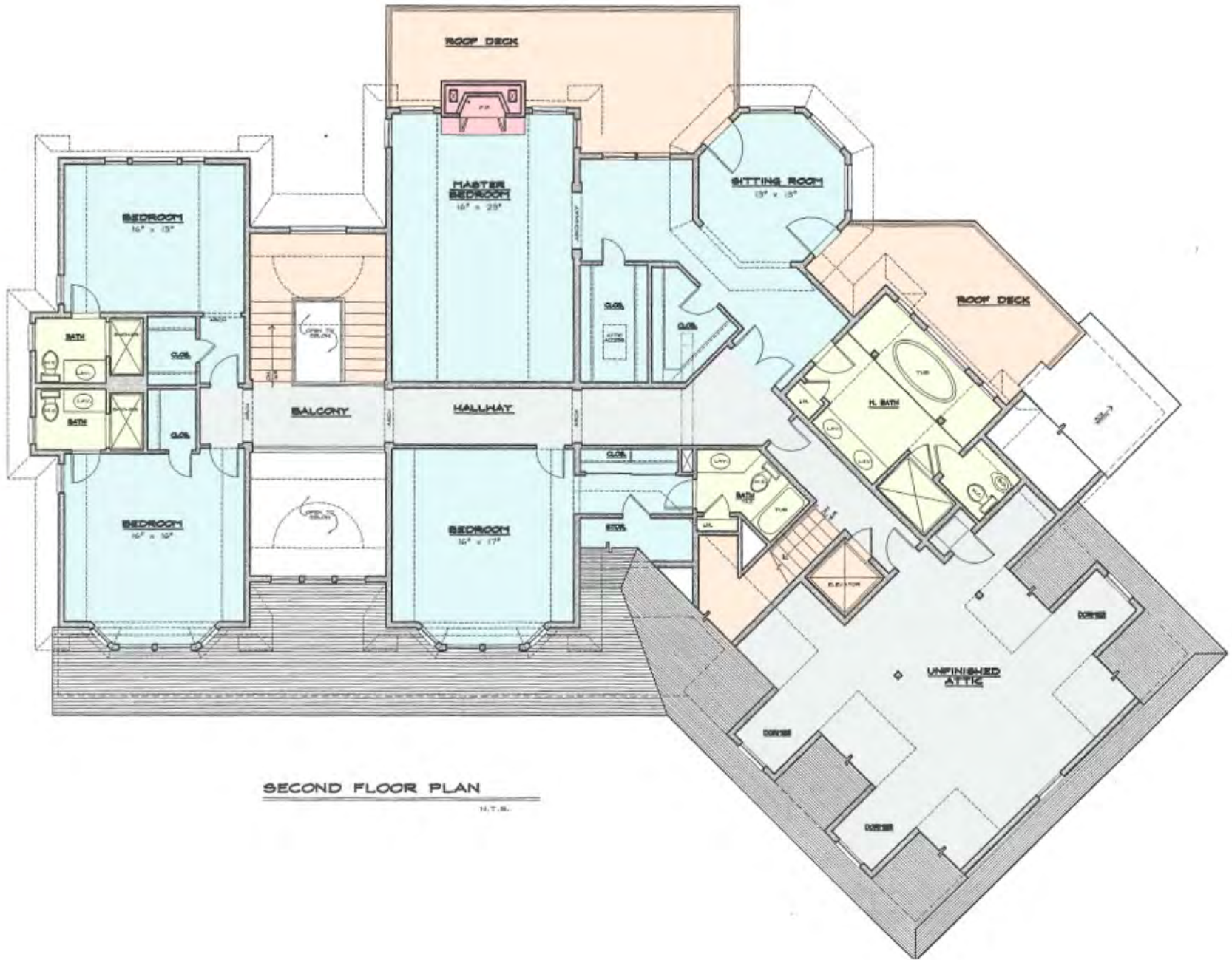
SECOND FLOOR PLAN N.T.S.