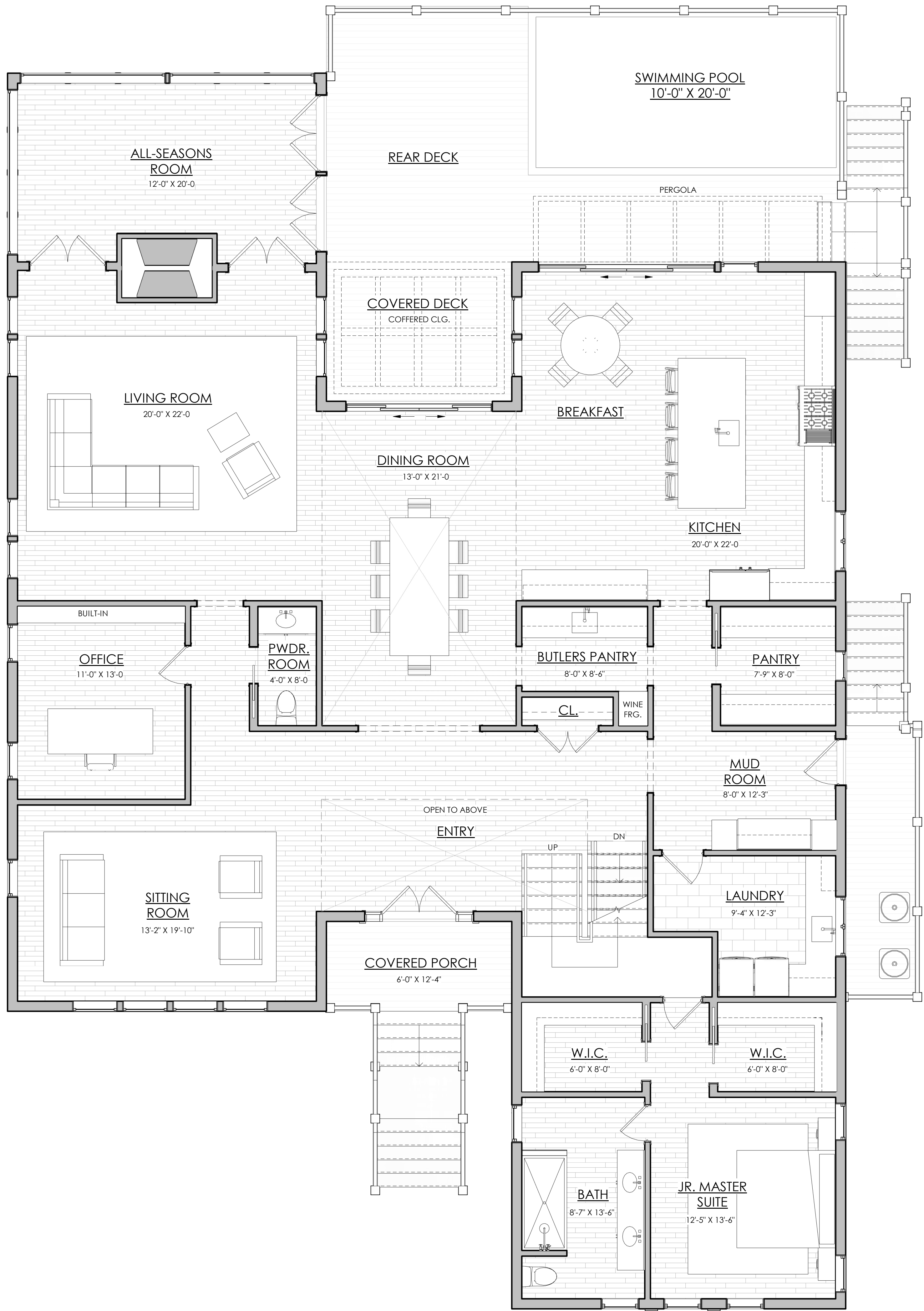
1 FIRST FLOOR PLAN 1/4" = 1'-0"