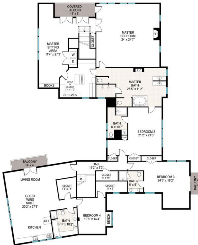
SECOND FLOOR INT. 3640 ft 2