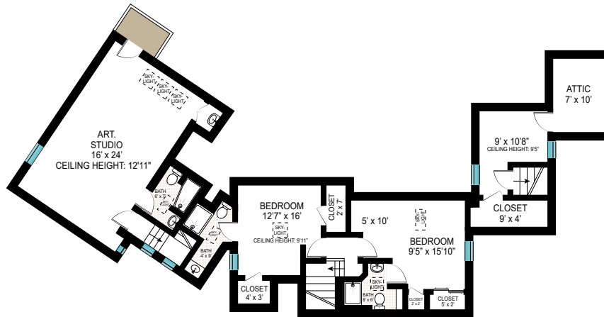
SECOND FLOOR CEILING HEIGHT: 9'11"