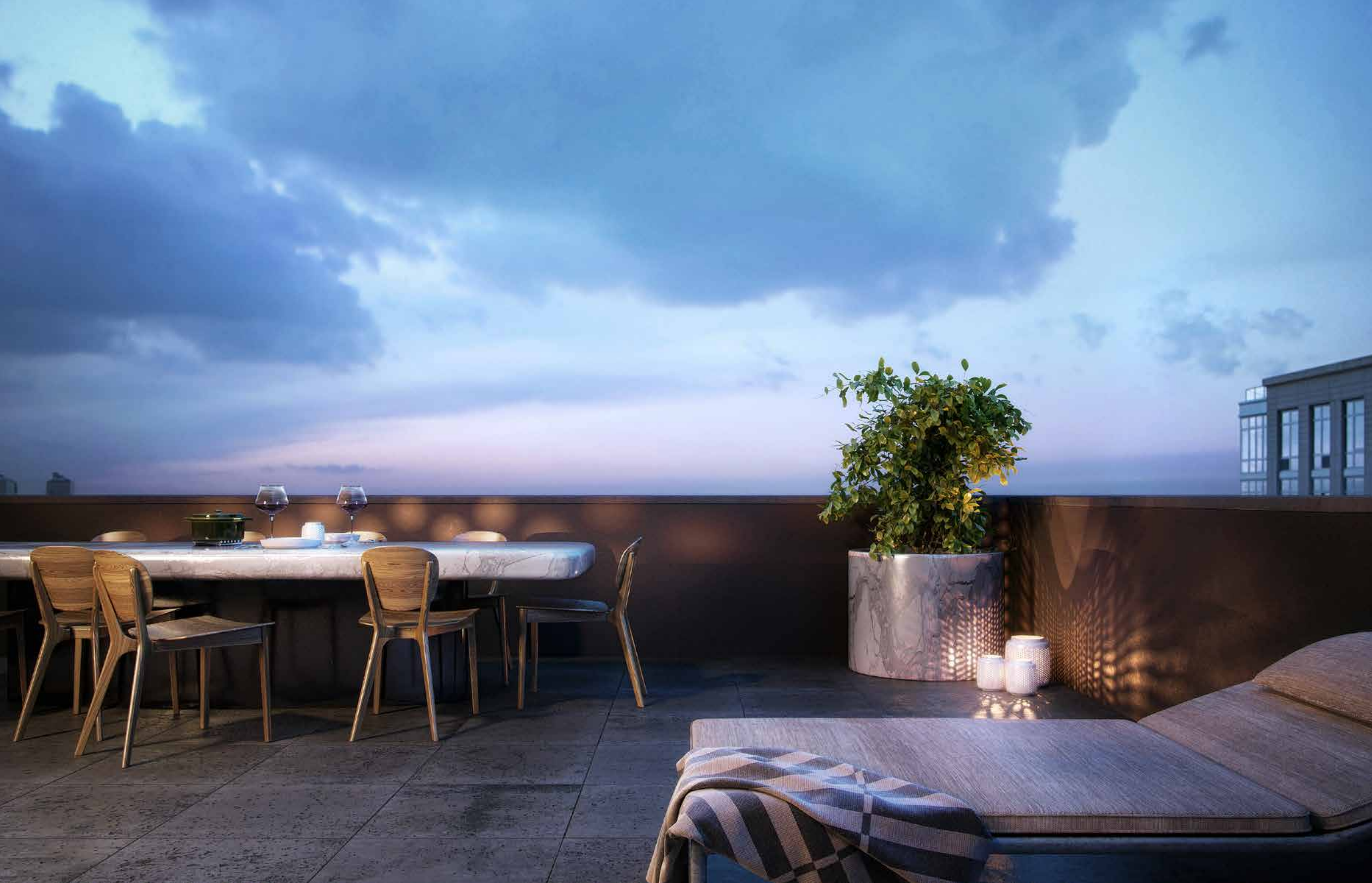
PENTHOUSE ROOF DECK WITH PANORAMIC VIEWS OF MANHATTAN.