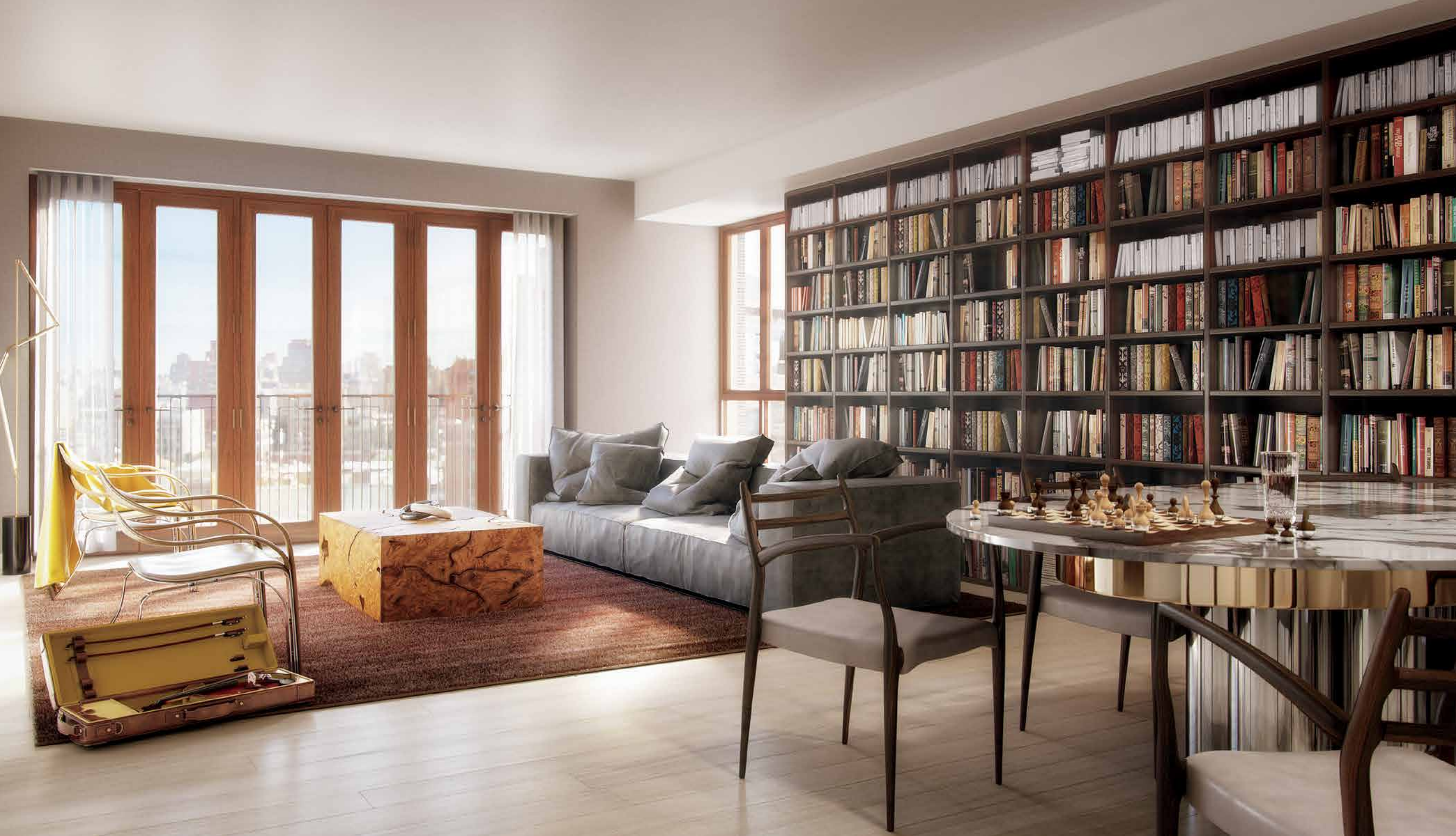
LIVING ROOMS FOUR TO TWELVE EAST