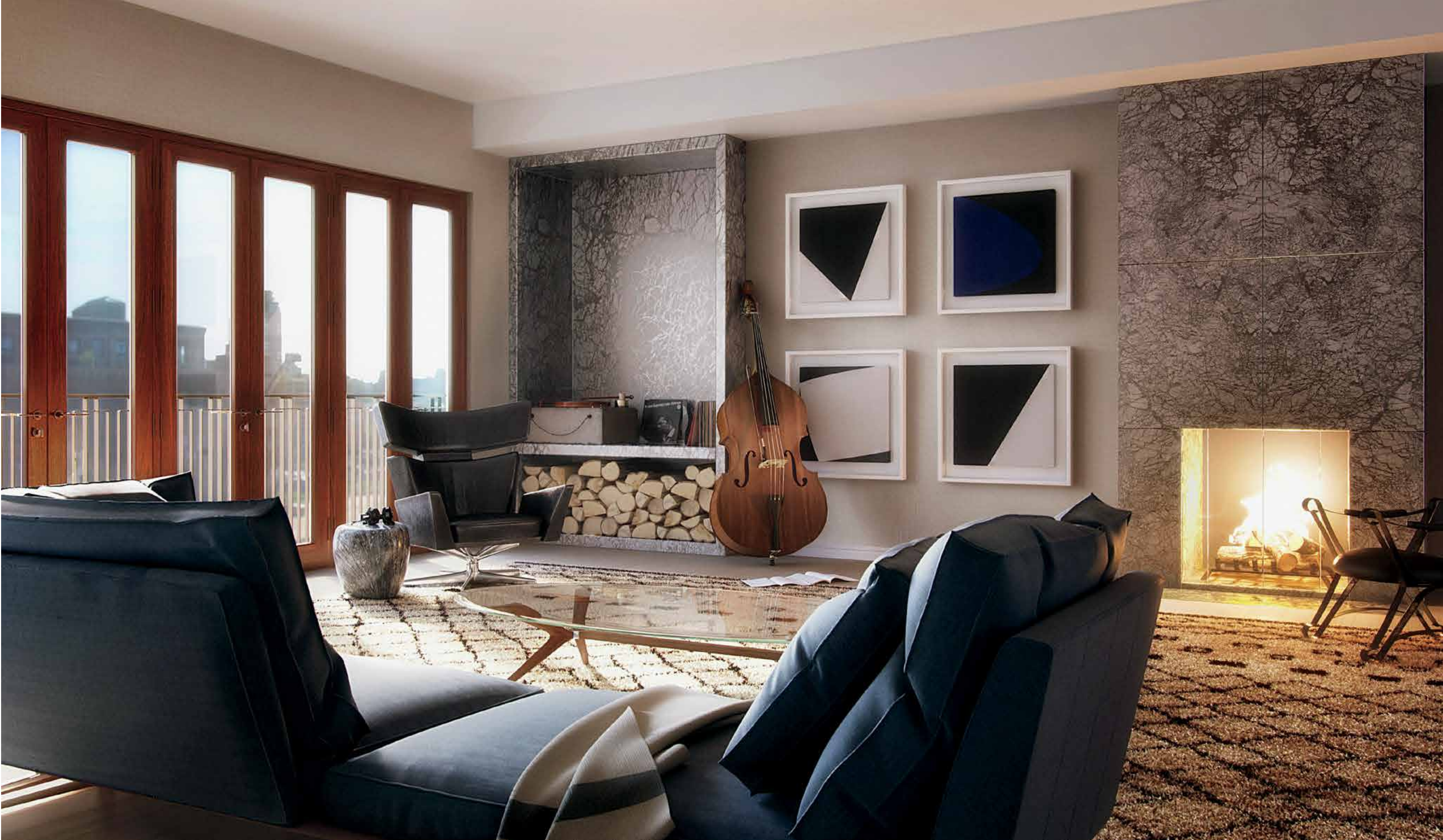
PENTHOUSE LIVING ROOM DUAL FUEL WOOD OR GAS BURNING FIREPLACES IN SELECT RESIDENCES, SURROUNDED BY FLOOR TO CEILING STONE.