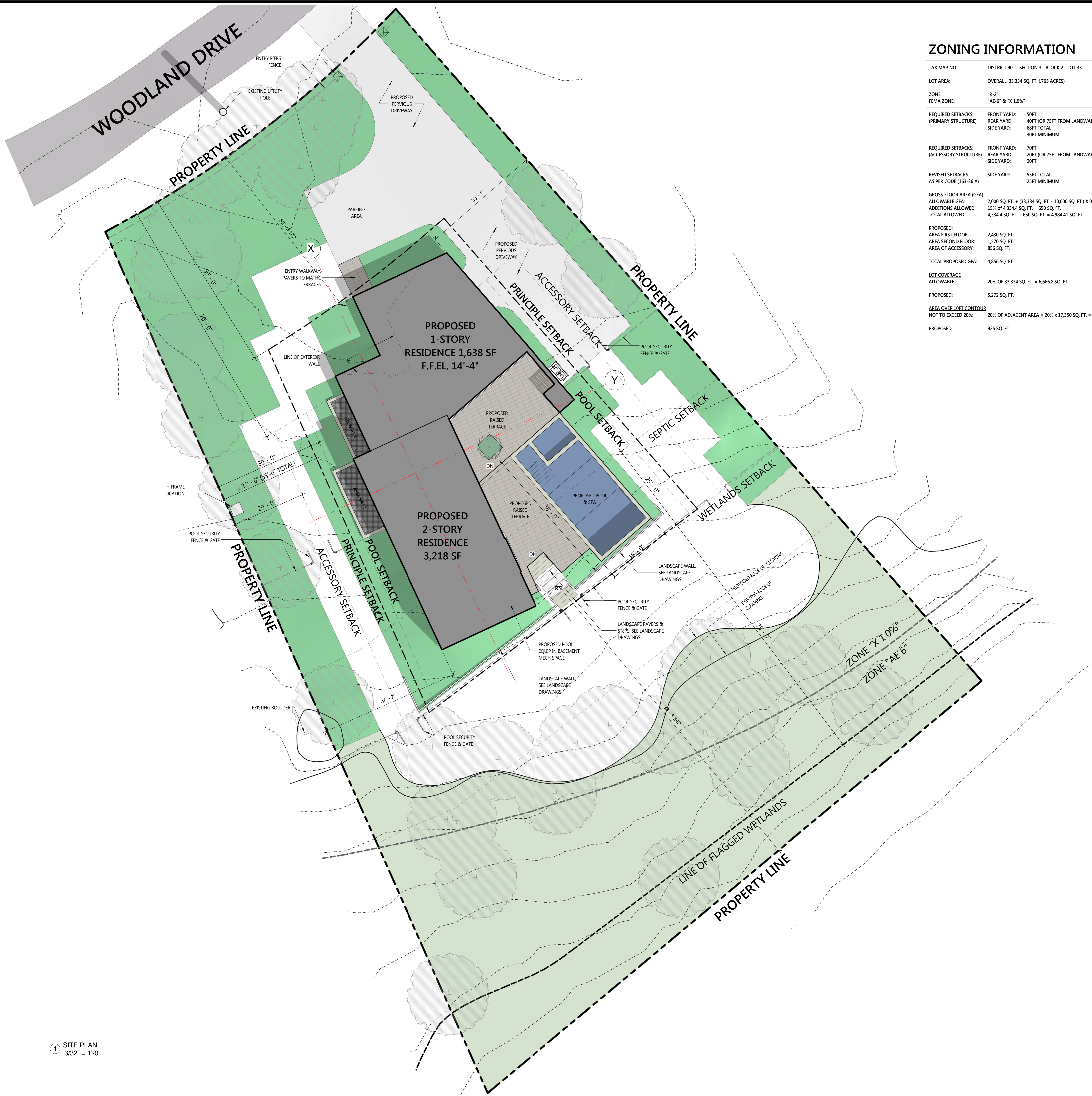
1 SITE PLAN 3/32" = 1'-0"